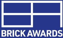
TABLE BOOKING FORM