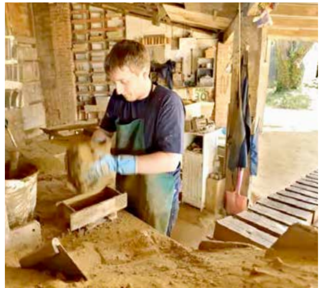
Hand made brick

Many tolerate the distressed state of reused brick, resulting from the process of reclamation, in the belief that there is no alternative. Several companies continue to make handmade bricks, including traditional clamp fired, produced in the same way as brick makers have done for centuries. Other companies have developed simulated handmade bricks, which look handmade but have been manufactured by modern machine methods.