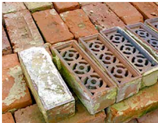
Precast panels to create details unachievable in hand set construction

If using Imperial bricks with a standard metric concrete block inner skin, adjustable wall ties may be required to overcome the differences in alignment of the bed joints created between the two. When using reclaimed bricks of 1965 Imperial standard size in metric gauged brickwork - i.e. four courses to 300mm - horizontal bed joints will be thinner compared with when traditionally gauged (four courses to 12") or when using metric bricks at four courses to 300mm. This will affect the overall appearance of the brickwork.