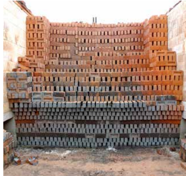
Bricks in a kiln

Frost resistance, soluble salts, strength, water absorption and size are all performance declarations that are covered by BS EN 771-1. Only new clay bricks are covered by this standard as all the relevant tests relate to samples drawn from newly manufactured consignments.